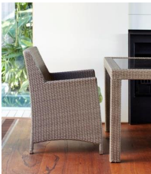
7 piece Dining